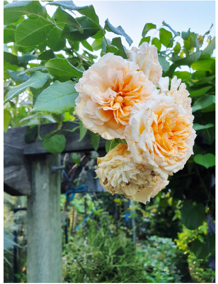
Heritage climbing rose possibly "Buff Beauty"